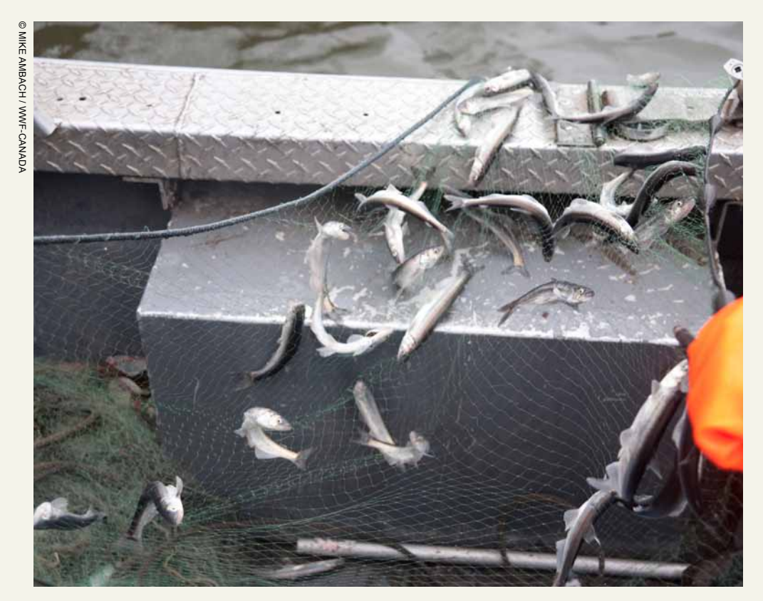
Eulachon been captured as part of First Nations monitoring efforts on the Skeena River

The approximately 70 kilometre-long Bella Coola River, for example, holds historical significance as a part of the Nuxalk-Carrier Grease Trail used by the explorer Sir Alexander Mackenzie when he completed the first east-to-west crossing of North America above Mexico in 1793. "Grease trails" are so-called because of their use in trade by First Nations, particularly trade of eulachon oil. Because almost 20% of the weight of eulachon is oil, they are caught and rendered to create condiments for food and preservatives for dried berries (Stoffels, 2001). The oil is rich in vitamins A and D, iodine, and other essential vitamins (Stoffels, 2001). Eulachon, like salmon, are anadromous fish and so live in the ocean but swim up rivers to spawn. Following spawning, eulachon soon die and their bodies, like salmon, also feed the ecosystem, likewise connecting the sea to the rivers to the rainforest.