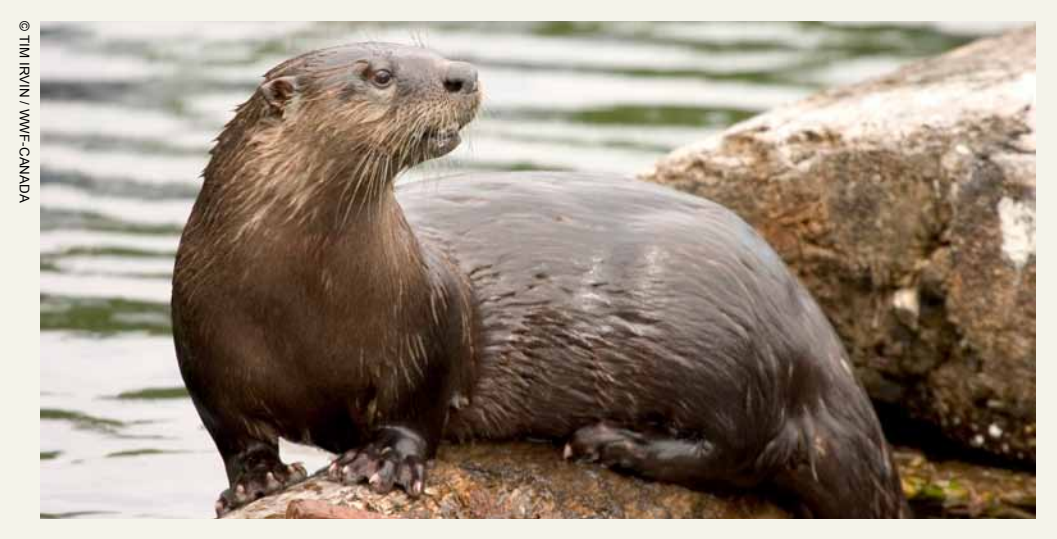
River Otters are common users of estuary habitat.

The waters that flow through the arterial rivers of the Great Bear are intimately tied to the survival and nourishment of hundreds of animal species. Approximately 230 bird species and 68 mammal species live in the region (Bergman, 1999). Among these mammals is the Spirit Bear, also known as the Kermode bear, a subspecies of American Black Bear that has a white or cream coat. At least 17 marine mammals live in the Great Bear Sea, into which the spectacular wild rivers drain. These coastal waters are also home to three out of five of British Columbia's major herring populations and 58% of anadromous salmon on the West Coast (Gunton & Broadbent, 2012), and it is up the undammed rivers of the Great Bear that these salmon swim to spawn.