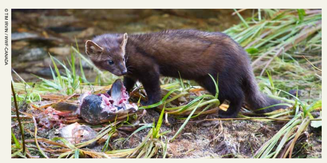
Martin in the Great Bear feed off salmon carcases left by others

An oil spill into a wild river of the Great Bear would not only poison fish, it could destroy the banks of the rivers, disrupting feeding cycles for bears and birds. The economies and livelihoods of those who live by the rivers would be devastated. Recent revelations about the 2010 Enbridge oil spill in the Kalamazoo River show just how severe the impacts can be.