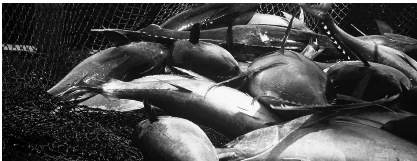
Yellowfin Tuna in seine. Tuna purse-seine fishery in the Atlantic Ocean.