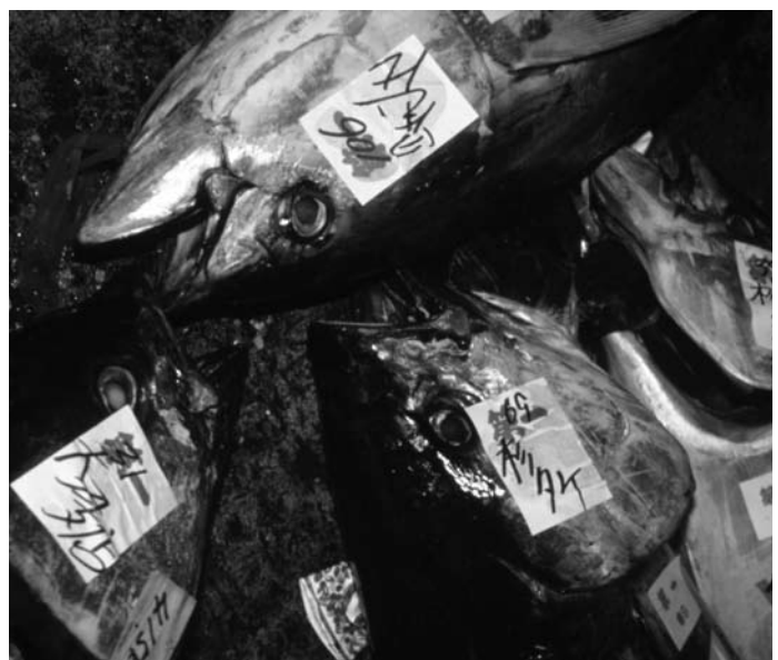
Tokyo fish market where Bluefin and Yellowfin Tuna are being processed for sale. Tokyo, Japan.