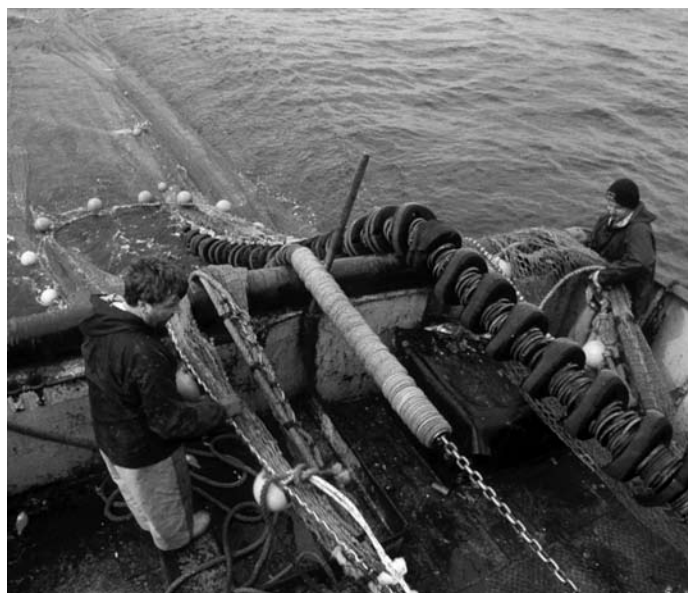
Shooting away the trawl on a North Sea trawler.

Attempts to improve the performance of RFMOs require the causal factors of poor performance to be clearly identified. Although each individual RFMO operates in a relatively unique geo-political environment there is nevertheless a strong degree of commonality in the factors affecting their performance. IUU fishing by highly mobile fleets under the control of multinational companies is widely recognized as a major threat to the sustainability of the world's living marine resources as well as the broader marine environment in which fishing activity takes place and much work has been done in attempting to identify ways in which IUU fishing can be prevented, deterred and eliminated.