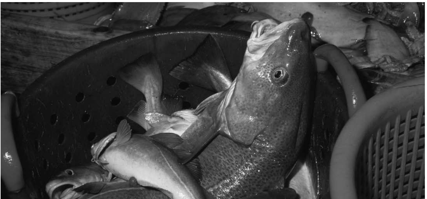
Cod in bucket on deep sea trawler North Atlantic Ocean.